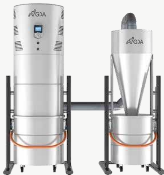
Vortex paired with Monoblock Central Unit