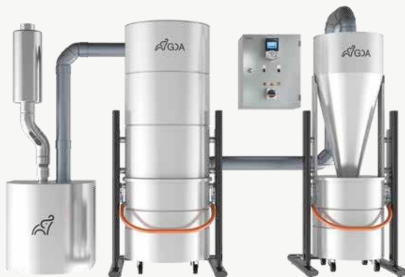
Vortex paired with Commercial Central Unit