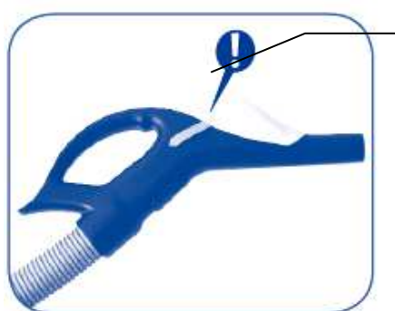
Programming Button of Brava Wireless Handle

Completed the alignment procedure between the Master and Slave must program the Brava Wireless Handle with the Master, how to proceed: